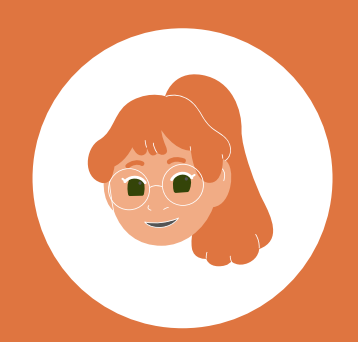
Outsource for technology guidance and expertise