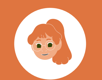
Outsource for technology guidance and expertise